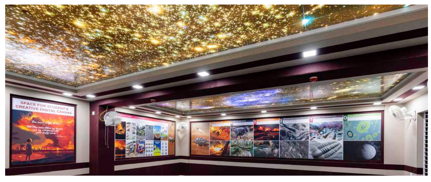
First-of-its-kind STREAMS (Science, Technology, Research, Engineering, Arts, Mathematics, Sports) Platform in India

Classrooms transcend the traditional notion of brick-and-mortar structures at KTGS; they embody dynamic environments meticulously crafted to nurture intellectual growth, foster social development, and shape the future of every individual. Our commitment to innovative education is reflected in our one-of-a-kind conceptual classrooms. Each room, themed around captivating subjects such as the universe, evolution of life and space exploration catalyzes curiosity. These thoughtfully designed spaces inspire students not only to learn but to actively engage, explore, and delve deep into their subjects. By intertwining education with fascination, we cultivate a natural love for learning in every student, encouraging a journey of exploration and discovery at KTGS.